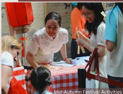
Mid-Autumn Festival Activities