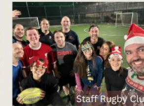
Staff Rugby Club