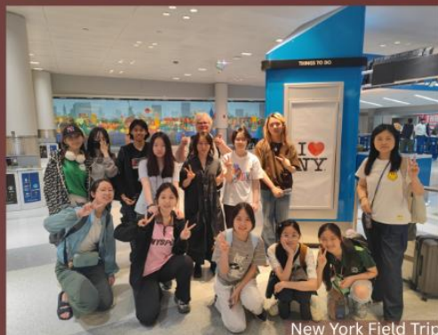
New York Field Trip