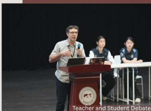
Teacher and Student Debate