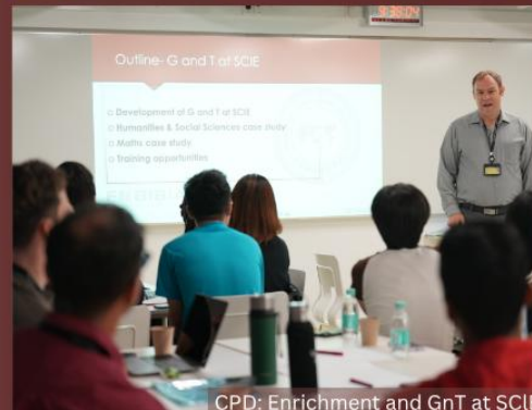
CPD: Enrichment and GnT at SCIE