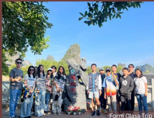
Form Class Trip