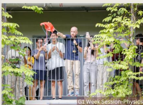
G1 Week Session-Physics