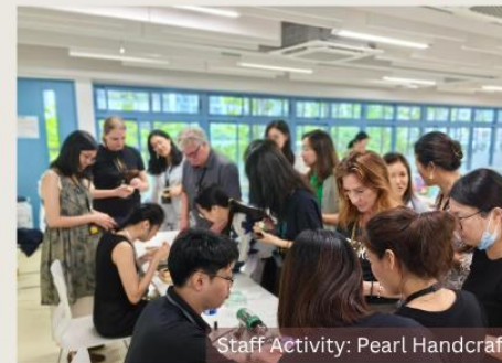
Staff Activity: Pearl Handcraft